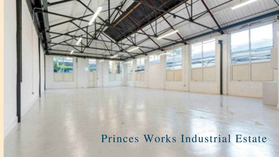
Princes Works Industrial Estate